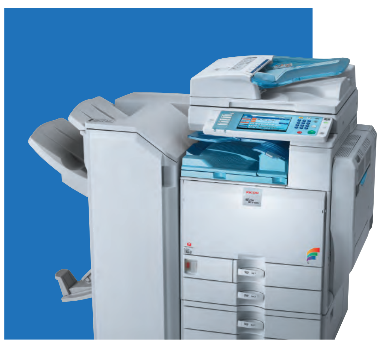
Aficio MP C3500/MP C4500